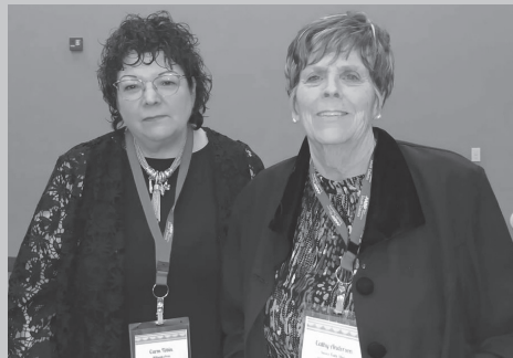
Sioux Falls Community Service award Silver