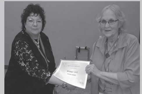
Winner Community Service award Bronze