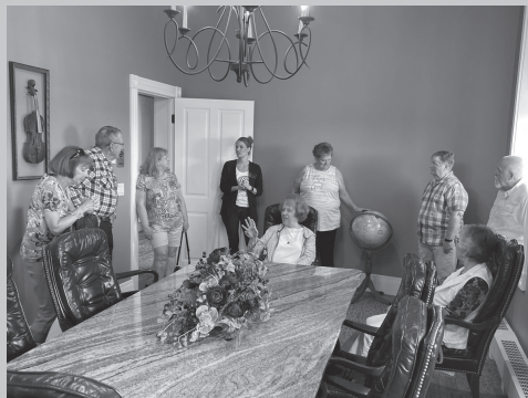
Members check out the conference room at the Goss Opera House.

We are now planning programs for our next year beginning with a potluck picnic and membership drive at Bramble Park Zoo.