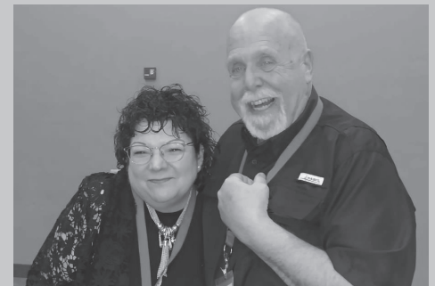
Watertown Community Service award Gold