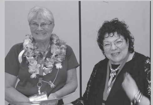
Redfield Community Service award Silver