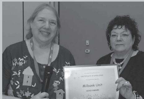
Milbank Community Service award Gold