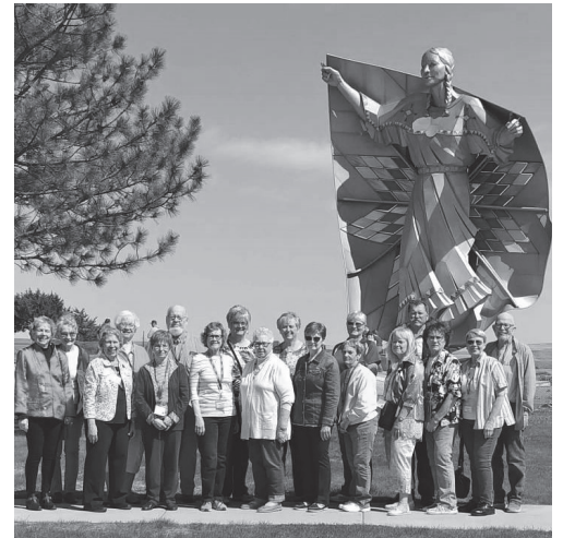
Pre-convention group toured Dignity, Akta Lakota Museum and SD Hall of Fame.