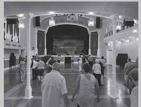
WARSP members marvel at the renovations of the Goss Opera House.