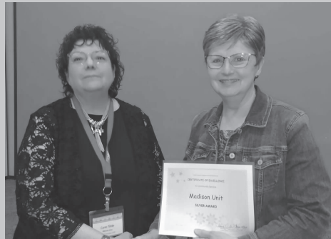
Madison Community Service award Silver