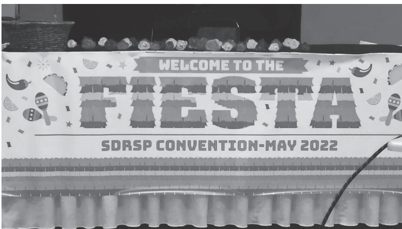
The Memorial Service honored 42 members lost in 2021-2022 by displaying a flower blossom in their memory as their name was read aloud.