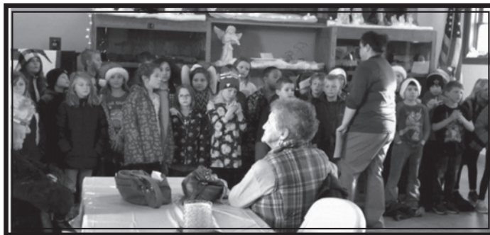
Fourth grade carolers at RARSP Christmas