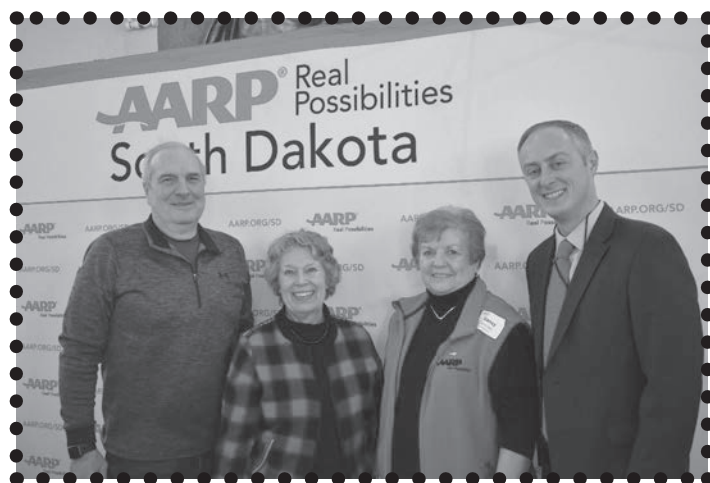
Photo from Lobby Day, January 29, 2019.