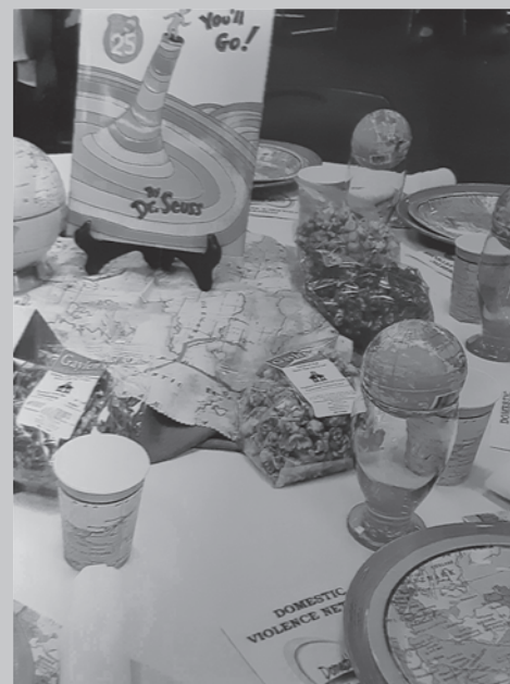
Table setting at the Tour of Tables event

The MARSP group held the Christmas party luncheon at Nicky's restaurant in Madison. Treasure Trivia and Bus Bingo were enjoyed, and everyone went home with extra cash and/or DQ coupons.