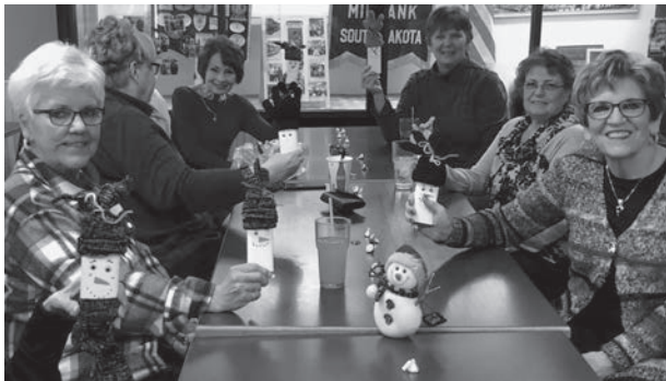
MARTA Members showing off their snowman projects

Our regular March meeting will be held on St. Patrick's Day, so why not have a St. Patty's Day Party? Wear green!