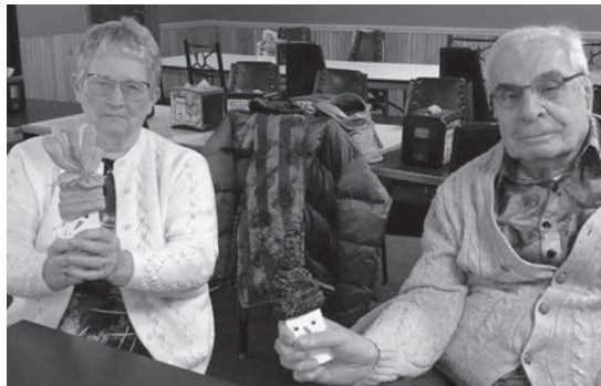
Saegers show off their snowmen projects