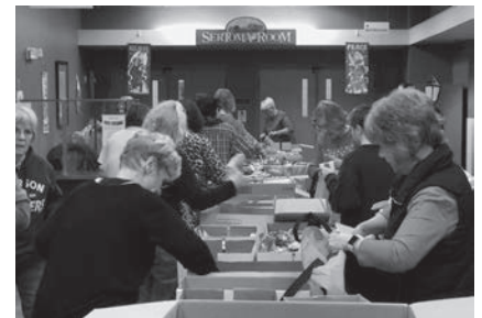
We are volunteering here filling Christmas gift bags for 500 Meals on Wheels clients and other seniors.