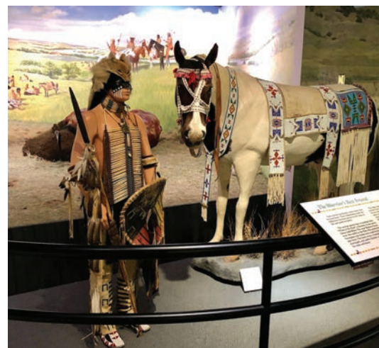
Display at the Atka Lakota Museum