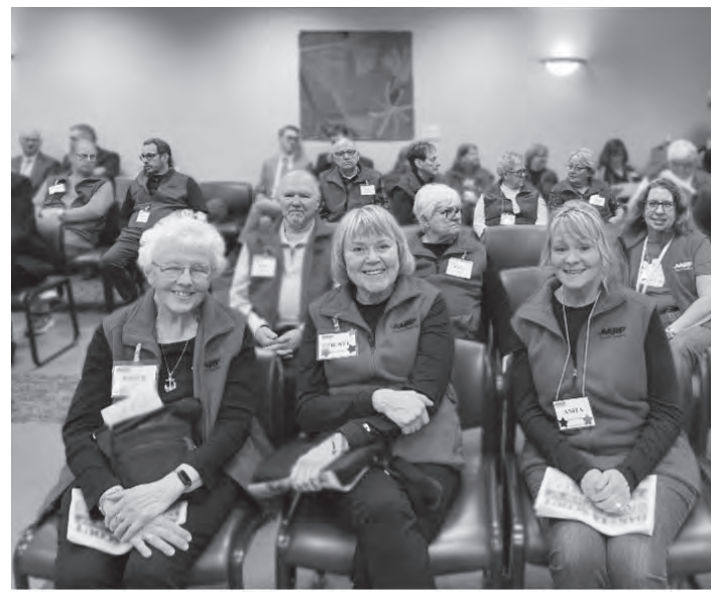
Attendees sat in on legislative committee hearings.