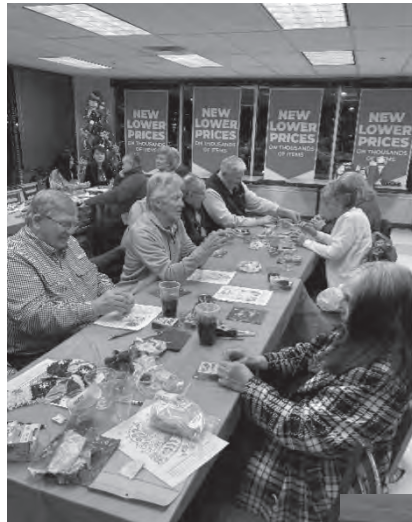
WARSP members participate in a coloring activity at the annual Christmas party.

Future meetings include a visit from an audiologist, a program by our local Educators Rising group, middle school musical entertainment and a visit to Castlewood where members will tour the museum, have lunch, and tour the Castlewood school renovations.