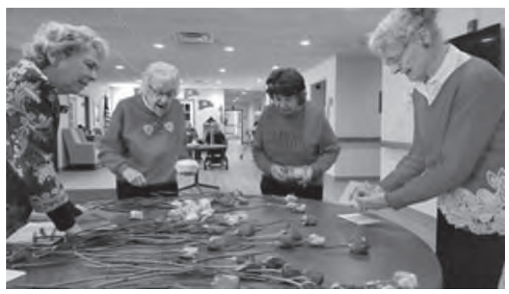
BHRSP Cupid Crew

February, we participated in the nationwide project of Cupid Crew. We received 200 beautiful long-stemmed roses of different colors. Teams of BHRSP members went to three different senior centers to deliver roses. What a joy it was to watch people decide what color rose they would like.