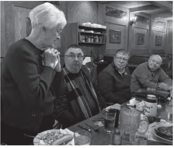
Speaker from Exchange Club for Aberdeen Area RSP

We continue to connect with the community and support public education.