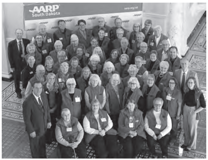
Governor Rhoden joined the group for a picture at the Capitol.