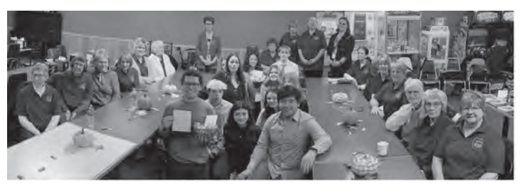
Educator's Rising students presented program for MARTA