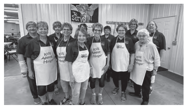
MARTA packed Mercy Meals

Our meeting in February was canceled due to the COLD weather, but the Grandparent Essay Committee met to judge 5th grade essays.