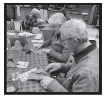
Retired teachers are making boxes for their homemade fudge.