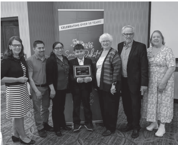
Grandparent Essay Winner

The Well Done Players from Rapid City entertained attendees with clever, well-written happenings in the 1960's.