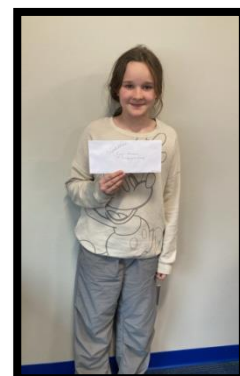
Grandparent Essay winner