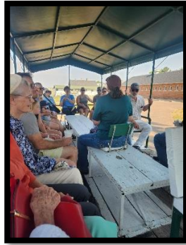
An old-fashioned trip around Fort Robinson with a driver and guide.